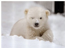
Baby pig pictures free. Baby shower invitation pictures free. Baby goat pictures free. Baby drawing pictures free download. Baby shower pictures free. Baby animal pictures free download. Baby deer pictures free. Baby profile pictures free download.