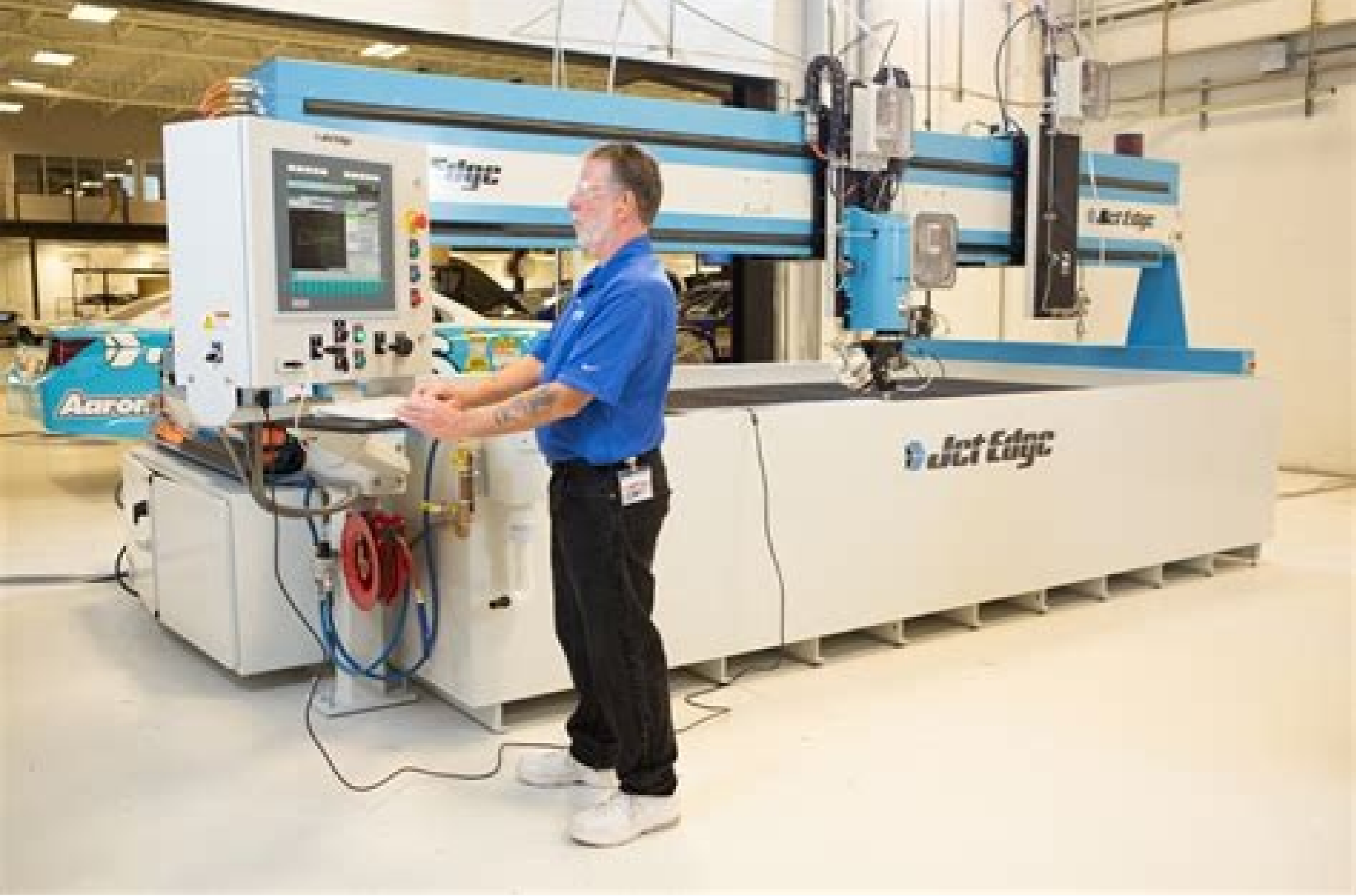
Water Jet and Abrasive Water Jet Machining: A Survey of Capability of a Machine in the Field